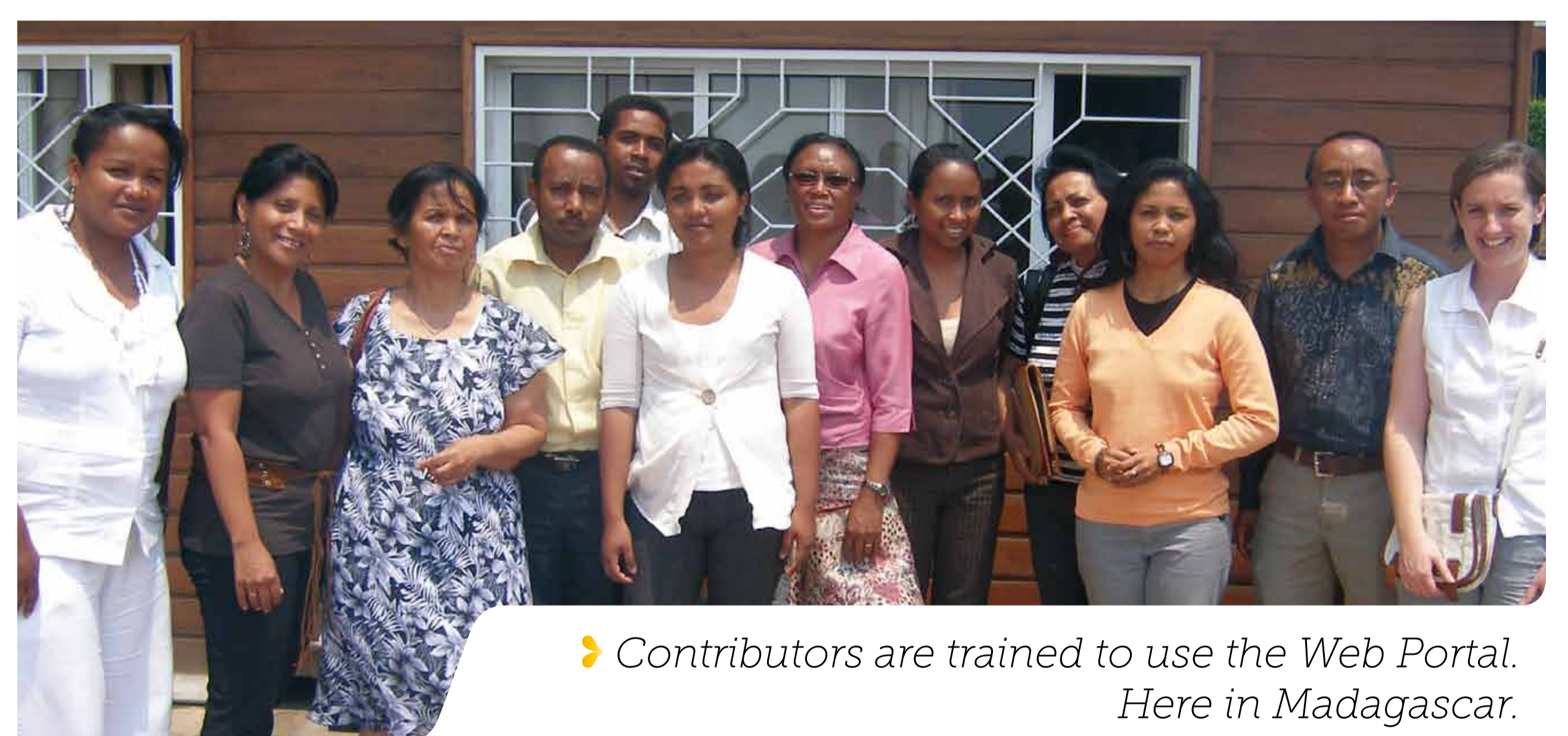
➤ Contributors are trained to use the Web Portal. Here in Madagascar.

Specialists can become contributors and post information as well as having a private area for their projects on agriculture and biodiversity.