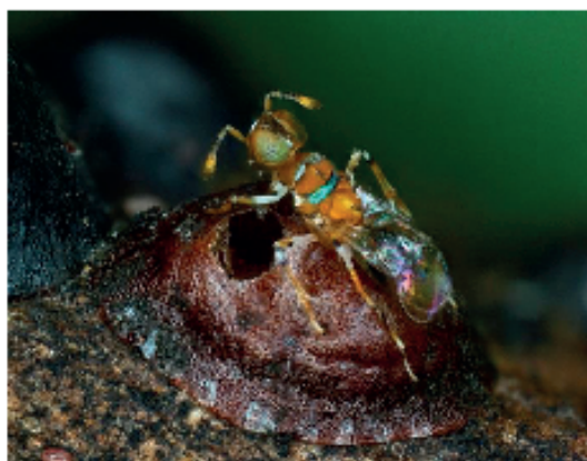
Diversinervus sp. , a parasitoid of Saissetia hemispherica on custard apple

Agro-ecological crop protection (ACP) is an innovative, ordered approach that stems directly from applying the principles of agro-ecology to crop protection, in which ecological aspects are truly centre-stage. ACP aims to reconcile efficient crop protection against pests and diseases with the socioeconomic, ecological, environmental and sanitary sustainability of agro-ecosystems. It is also intended to make a substantial contribution to the switch from agrochemical-based practices to agro-ecological practices within cropping systems.